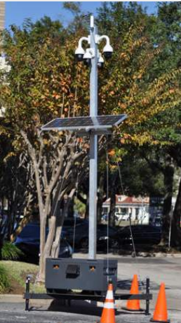
Free-Standing Pole with 4 Pan-Tilt-Zoom (PTZ) cameras & loudspeaker

Ideal for longer term placement in parking lots, shopping centers, apartment complexes, industrial properties, etc.