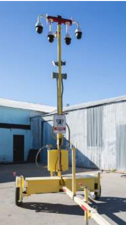
Electric Plug-In Unit with 4 Pan-Tilt-Zoom (PTZ) cameras & loudspeaker

Ideal for shopping centers, apartment complexes, parking lots, and construction sites with power.