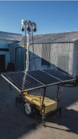
Solar Unit with 4 Pan-Tilt-Zoom (PTZ) cameras & loudspeaker

Ideal for sites without available AC power, temporary locations, and for rapid deployment, including construction sites, remote parking areas, illegal dump sites, events and festivals, etc.