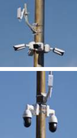
Pole-Mounted with 4 Pan-Tilt-Zoom (PTZ) cameras & loudspeaker

Ideal for long term placement in parking lots, shopping centers, apartment complexes, industrial properties, etc.